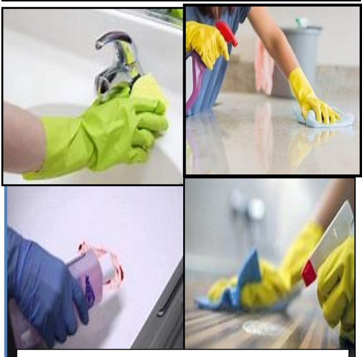
CLEANING OF FAUCETS, FLOOR, DOORS, HANDLES, BATHROOMS ETC